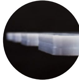
female machined edges

sinter pressed for superior durability and performance