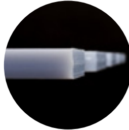
male machined edges

New Hybrid-Lock Connection system featuring male and female machined edges Patent Pending